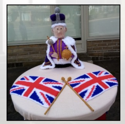
Unfortunately, someone in the surrounding area, or maybe just a passer-by decided that the King shouldn't be adorning the post box and

During the last three months we celebrated along with the rest of the Country the Coronation of King Charles III and once again our Knit and Natter Group prepared this <u>CORONATION</u> <u>POST BOX TOPPER</u> – and doesn't it look great?