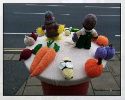
The latest 'Harvest' local Post Box Topper knitted by the Ladies of the Knit & Natter Craft Group.