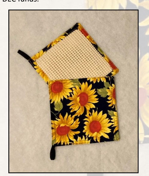
30 metres of fabric, 8 large reels of

positive comments. We do still have a little fabric left, so please do get in touch with us if you still want a bag or gripper.