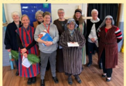
Open the Book Team

We are looking forward to doing 'It's Your Move' lessons as Year 6 children move up to Secondary Education.