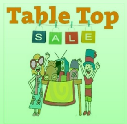
Table Top Sale

Boothtown and Southowram had two special collections and two special coffee mornings to raise funds to be sent to the Halifax Ukraine Club so that they could buy what they needed to send to the people of Ukraine, we raised £650.