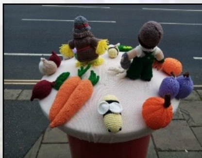
The latest 'Harvest' local Post Box Topper knitted by the Ladies of the Knit & Natter Craft Group.